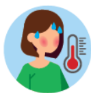
A high temperature, 37.8 and above