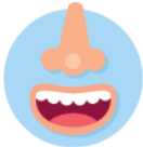
A loss of or change in your sense of taste or smell