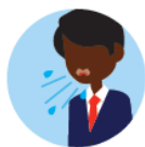
A new continuous cough

Key Symptoms. It is sometimes hard to differentiate between COVID-19 symptoms and those of a winter illness. COVID-19 symptoms are: